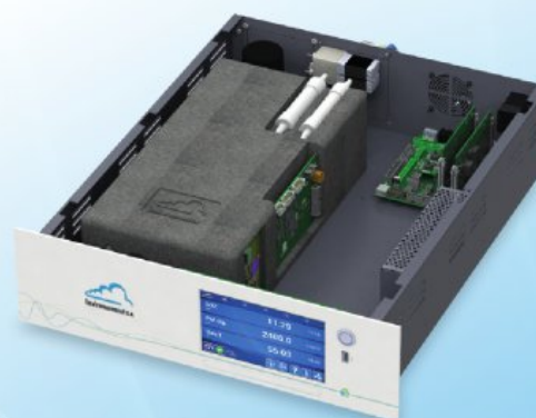
AF22e analyzer: internal view